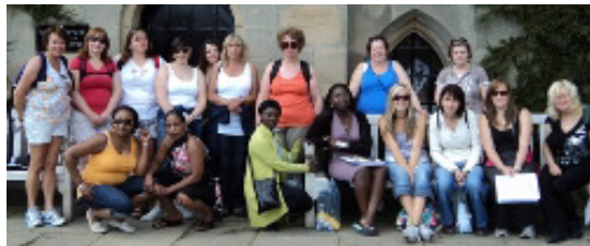
Women's Weekend 2011

*Individual names have been changed to maintain anonymity. For the full story visit www.mosaicchurch.co.uk .